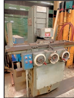
BROWN & SHARPE 618 MICROMASTER SURFACE GRINDER