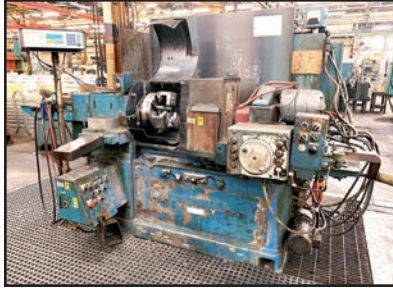
CINCINNATI/HEALD 271 SIZEMATIC INTERNAL GRINDER