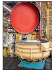
ROSLER R-780 FLAT BOTTOM ROTARY VIBRATOR

ROSLER R-780 FLAT BOTTOM ROTARY VIBRATOR , s/n 43923/08