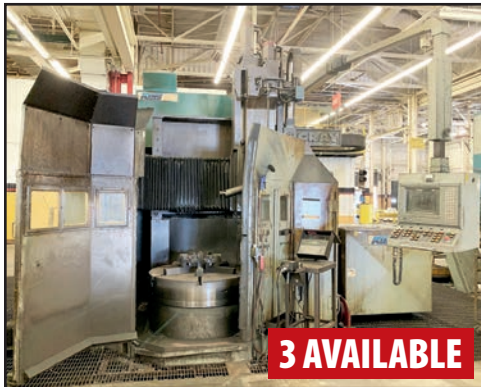
GRAY RM 48" CNC VERTICAL TURRET LATHE