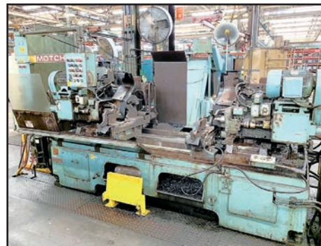
MOTCH 1648 MC MILL AND CENTER MACHINE