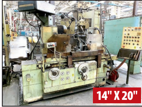
SCHAUDT A700S500 UNIVERSAL GRINDER