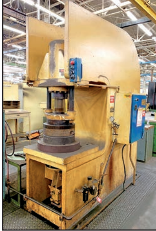
100-TON HANNIFIN HYDRAULIC PRESS