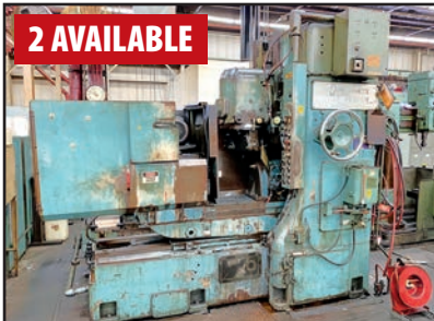
RED RING GCX GEAR SHAVER