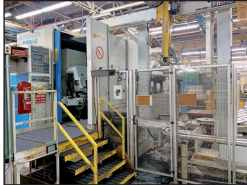
PFAUTER P600G CNC GEAR GRINDER