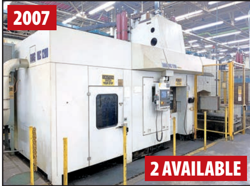
2007 EMAG VLC 1200 INVERTED SPINDLE VERTICAL TURNING CENTER