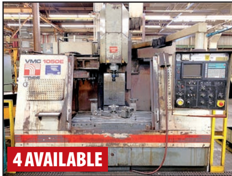
TREE VMC 1050E/24 CNC VERTICAL MACHINING CENTER