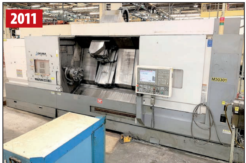
OKUMA MULTUS B400-W MULTITASKING CNC LATHE