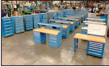
ASSORTED TOOL CABINETS AND WORK BENCHES