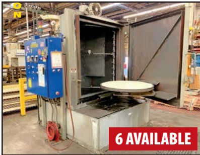
PROCECO HD 42X48-E-2500-1-BO ELECTRIC PARTS WASHERS

Inspection: Wednesday, August 21st from 8:00 AM – 4:00 PM CT (By Appointment Only)