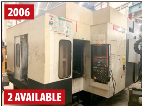
2006 MAZAK VARIAXIS 730-5X II CNC VERTICAL MACHINING CENTER