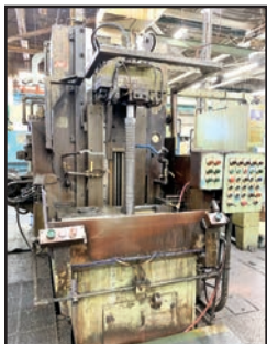
DETROIT BROACH AND MACHINE 35-TON X 72" STROKE VERTICAL BROACH