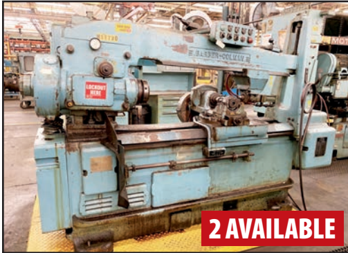
BARBER-COLMAN 16-36 UNIVERSAL GEAR HOBBER

(6) REDIN GEAR DEBURRERS , Magelis PLC Control, 2-Stand, 8" Chuck