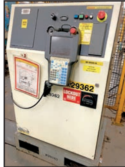
FANUC M-900IA 350 6-AXIS ROBOT