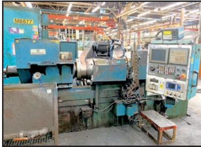
PRATT & WHITNEY 2440 A STEPMASER GRINDER