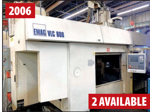
2006 EMAG VLC 800 INVERTED SPINDLE VERTICAL TURNING CENTER