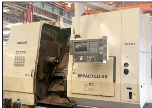
OKUMA IMPACT LU-45 CNC TURNING CENTER