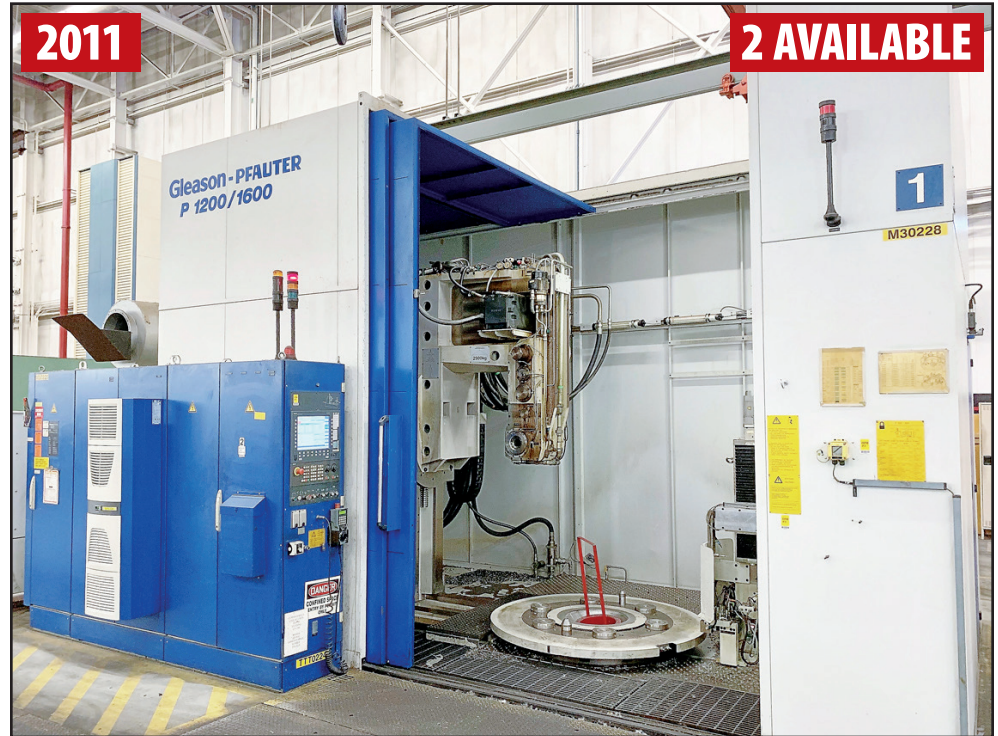
GLEASON-PFAUTER P 1200/1600 5-AXIS CNC PROFILE MILL

OVER 1,000 LOTS - HUGE SELECTION OF GEAR MACHINERY MACHINES TOOLS INCLUDING: CNC GEAR HOBBERS, GRINDERS, SHAPERS & DEBURRERS, VERTICAL TURNING LATHES, HMC'S, ID/OD GRINDERS, TOOLING, MANUFACTURING SUPPORT, MATERIAL HANDLING & MUCH MORE