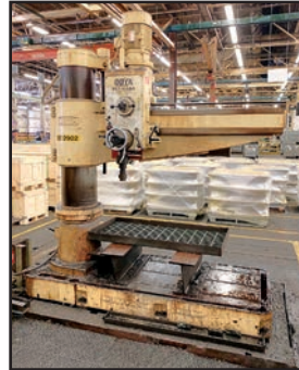
Ooya RE2-1450D 5' X 13" RADIAL ARM DRILL