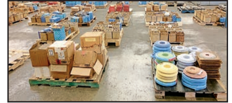
VIEW OF GRINDING WHEELS AND HOBS