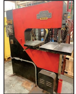
KALAMAZOO STARTRITE 30-R-10 VERTICAL BANDSAW