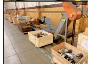
MACHINE PARTS / SPARES