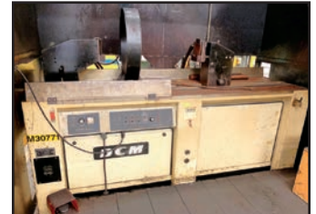
DCM TECH MPI 3062 MAGNETIC PARTICLE INSPECTION MACHINE

To discuss your requirements for an auction, please call Perfection Industrial +1-847-545-6374