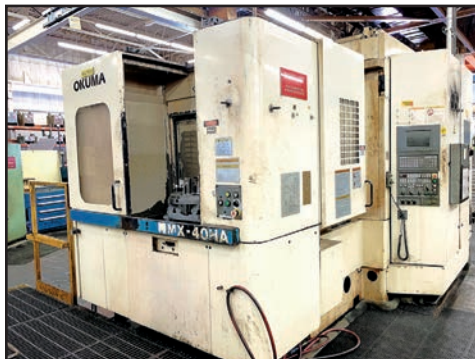
OKUMA MX-40HA CNC HORIZONTAL MACHINING CENTER