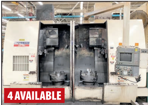
OKUMA & HOWA 2SP-V80 TWIN SPINDLE CNC VERTICAL LATHE