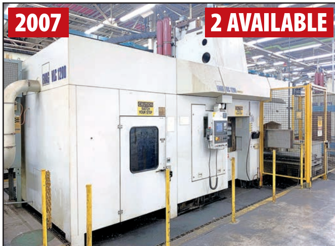
EMAG VLC 1200 INVERTED SPINDLE VERTICAL TURNING CENTER