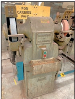
HAMMOND 12" DUAL END GRINDER