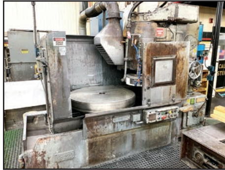
BLANCHARD NO 22 D ROTARY SURFACE GRINDER