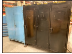
STRONG HOLD CABINETS