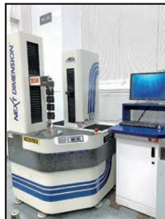
PECO NEXT DIMENSION ND300 GEAR ANALYZER