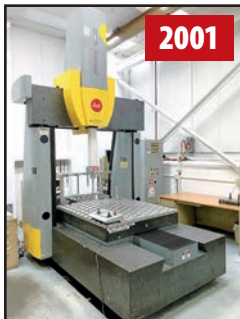
BROWN & SHARPE M00-153-300 CMM