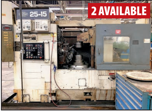
BARBER COLMAN 25-15 GEAR HOBBER