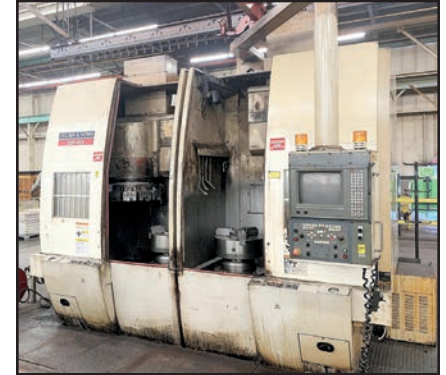
OKUMA & HOWA 2SP-V55 TWIN SPINDLE CNC VERTICAL LATHE