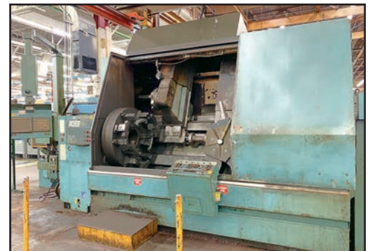
WARNER & SWASEY SC-45 M700 CNC TURNING CENTER

View our current auction schedule at www.perfectionindustrial.com