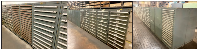
VIEW OF VIDMAR CABINETS