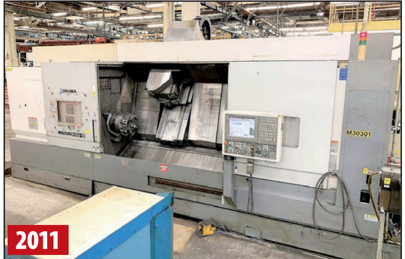
OKUMA MULTUS B400-W MULTITASKING CNC TURNING CENTER

WARNER & SWASEY SC10-54 CNC TURNING CENTER , s/n 2657146, Fanuc CNC Control, 12" Chuck, 6-Position Tool Post, Tail Stock