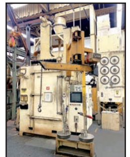
PROGRESSIVE TECHNOLOGIES PEEN BLAST SYSTEM