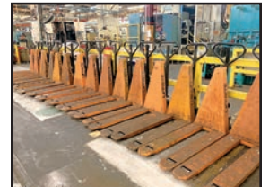
VIEW OF LIFT-RITE ELECTRIC PALLET JACKS

VIDMAR/LISTA TOOL CABINETS, MAINTENANCE CRIB W/LARGE ASSORTMENT OF BEARINGS, ELECTRONICS, SERVO MOTORS, MOTORS, CIRCUIT BOARDS, CONTROLS, RELAYS, CHIP CONVEYORS, MACHINE PARTS, ELECTRIC PALLET JACKS, (100+) CRANE SYSTEMS FROM GORBEL, CES, AND CLEVELAND AND MUCH MORE. 100'S OF ITEMS ADDED DAILY!