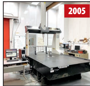
BROWN & SHARPE GLOBAL IMAGE 15 22 10 CMM