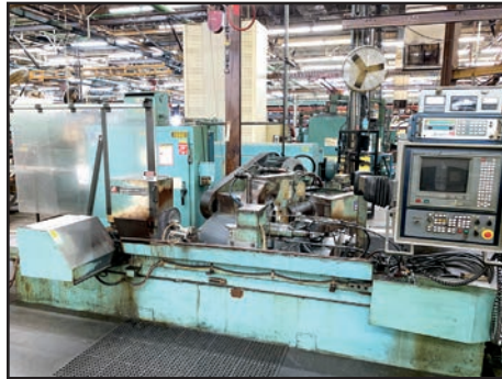
WARNER & SWASEY ACC1460A CNC ANGLE HEAD GRINDER