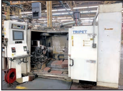
USACH TRIPET TST-250 ID/OD CNC PRECISION GRINDER