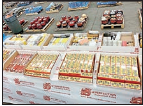
VIEW OF CARBIDE INSERTS

GRIEVE OVENS, LANTECH STRETCH WRAPPER, HANEL LEAN-LIFT VERTICAL STORAGE SYSTEMS, LARGE QUANTITY OF LISTA WORK BENCHES, VIDMAR BALL-BEARING TOOL CABINETS, STRONG-HOLD SHOP CABINETS, FLAMMABLE SAFETY CABINETS, PERISHABLE TOOLING, CARBIDE INSERTS, HOBS, AND MUCH MORE