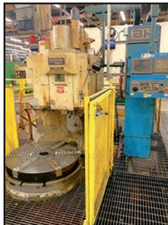
FELLOWS 50-8 HYDROSTROKE CNC GEAR SHAPER